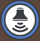
Whole Home Audio